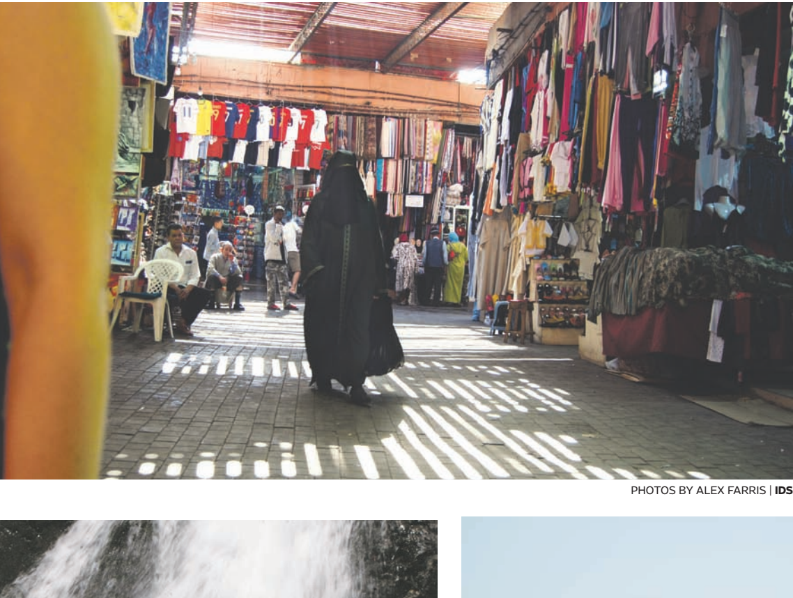
A woman walks fully veiled Tuesday in the souk, or market, of Marrakech. Moroccan society allows women to choose to follow either traditional modest dress (hijab) or individual standards of modesty.